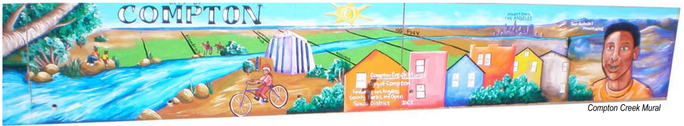
Compton Creek Mural